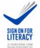
Finalist, Sign On for Literacy Challenge