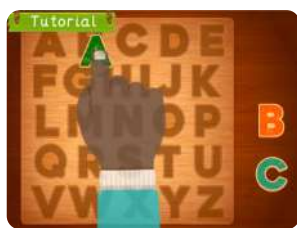
*Kitkit School Version 3 Contents (updated Nov 2018)

8 TOOLS FOR SUPPORT AND CREATIVE EXPRESSION